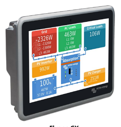
Ekrano GX front and back