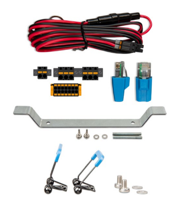
Accessories included with the Ekrano GX

The Ekrano GX installs easily via a cut-out for flush panel mounting and includes both a steel bracket and springs for blind hole mounting. All ports are easily accessible from the back. The power and relay terminal blocks can be screwed in place and the IO terminal block has a quick release clamp for easy access. The Bluetooth feature allows for quick connection and configuration via our VictronConnect app.