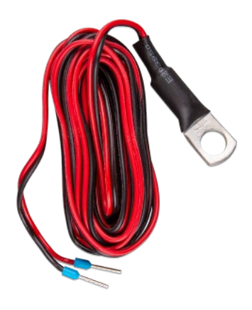
Temperature sensor for Quattro, MultiPlus and GX device (e.g. Ekrano GX) as an additional accessory.